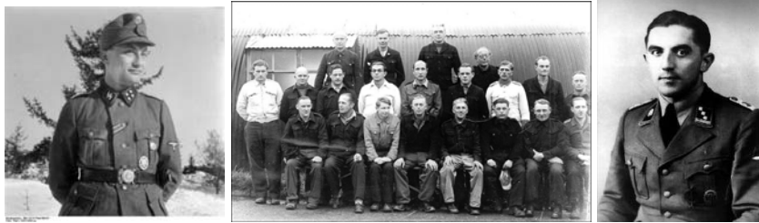
http://www.ww2incolor.com/d/367340-2/Bundesarchiv_Bild_101III-Theil-008-01_2C_Gunter_d_27Alquen http://img.thesun.co.uk/multimedia/archive/00834/SNF27SPDD-682_834404a.jpg http://www.aktive-fredsreiser.no/bilder_tidsvitner/hoppe.jpg