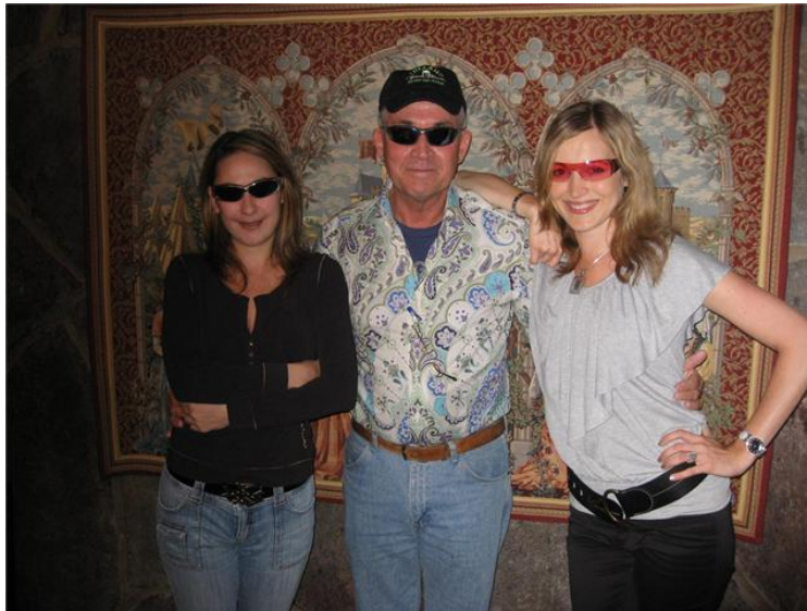
Irish Drinking Team, Kazakhstan cell.jpg