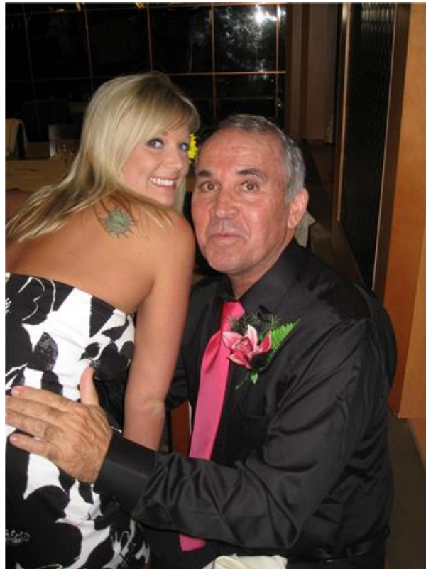
Agent Bean's body double, Agent April Cunning, Tattoo ID complete, debriefing next.jpg

As the Agents reviewed their briefing guides, Marquis d'Cartier sent each pair of Agents to their private VIP pods for the 9 hour and 11 minute crossing to Dublin. As Chips and Stevie headed for Pod A, James Crosby and Bravo Zulu headed for Pod B.