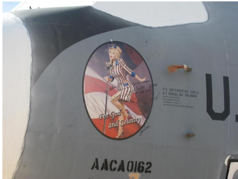
A nice lady who I flew to LA twice from Nashville HARD CANDY CHRISTMAS.jpg