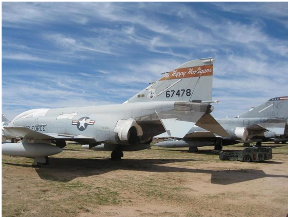
AF 66-7478 only survivor from Fargo 'intact'.jpg