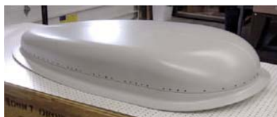
Antenna / Radome