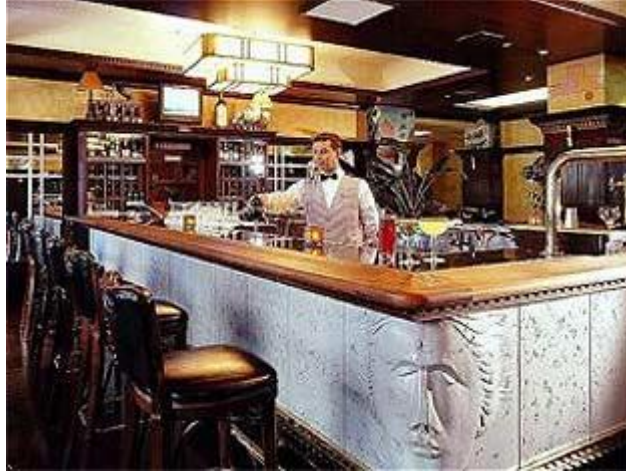
Stone Rose Lounge by Rande Gerber features signature cocktails and a sleek atmosphere. Design by Yabu Pushelberg .. chic indoor lounge with VIP room, along with outdoor cabanas.