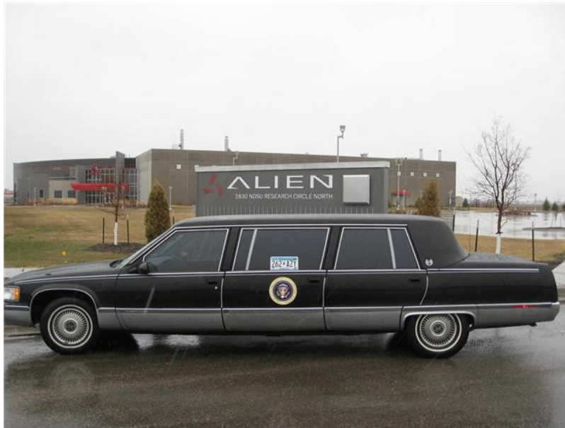
Alien President gets Chips' attention Amalgam Trident Broken Cup.jpg

http://neveryetmelted.com/wp-images/TripleCross.jpg