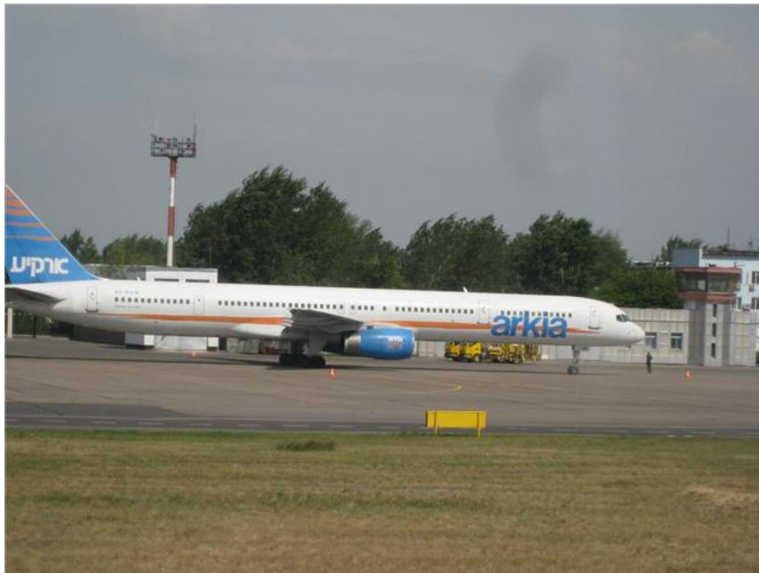
An Israeli representative to the World's Religion Conference 1-2 July Astana KZ.jpg