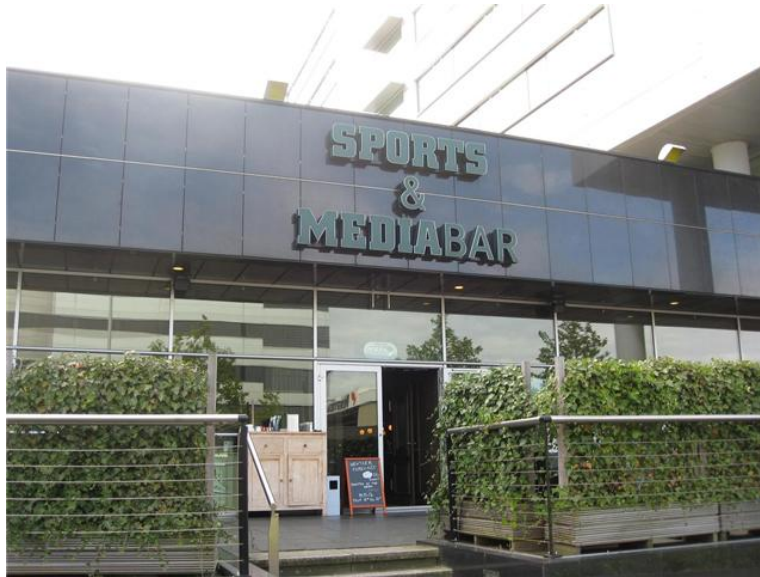
An outside view of S&M Bar with 'Martinair' Hangar in reflection.jpg

"Not exactly Stone, since the Mosquito wasn't there when I came out, I will use the escape rope to climb up through the window. Please Clipper Jam and let her know that she is about ready to be joined by someone coming through the window. Remember, 15 minutes."