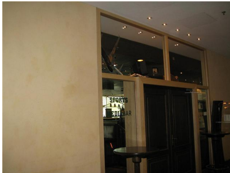
A Boeing Going Down from outside S&M.jpg

"And don't come back a-drinkin' with lovin' on your mind, Chips.." cautioned Jam as she ran a warm bath and lit candles and search for the wine bottle opener.